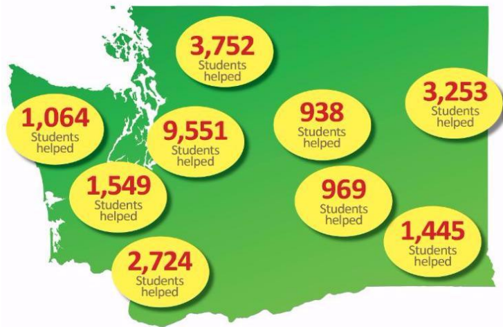
2016-2017 School Year